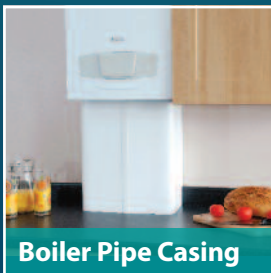
Boiler Pipe Casing